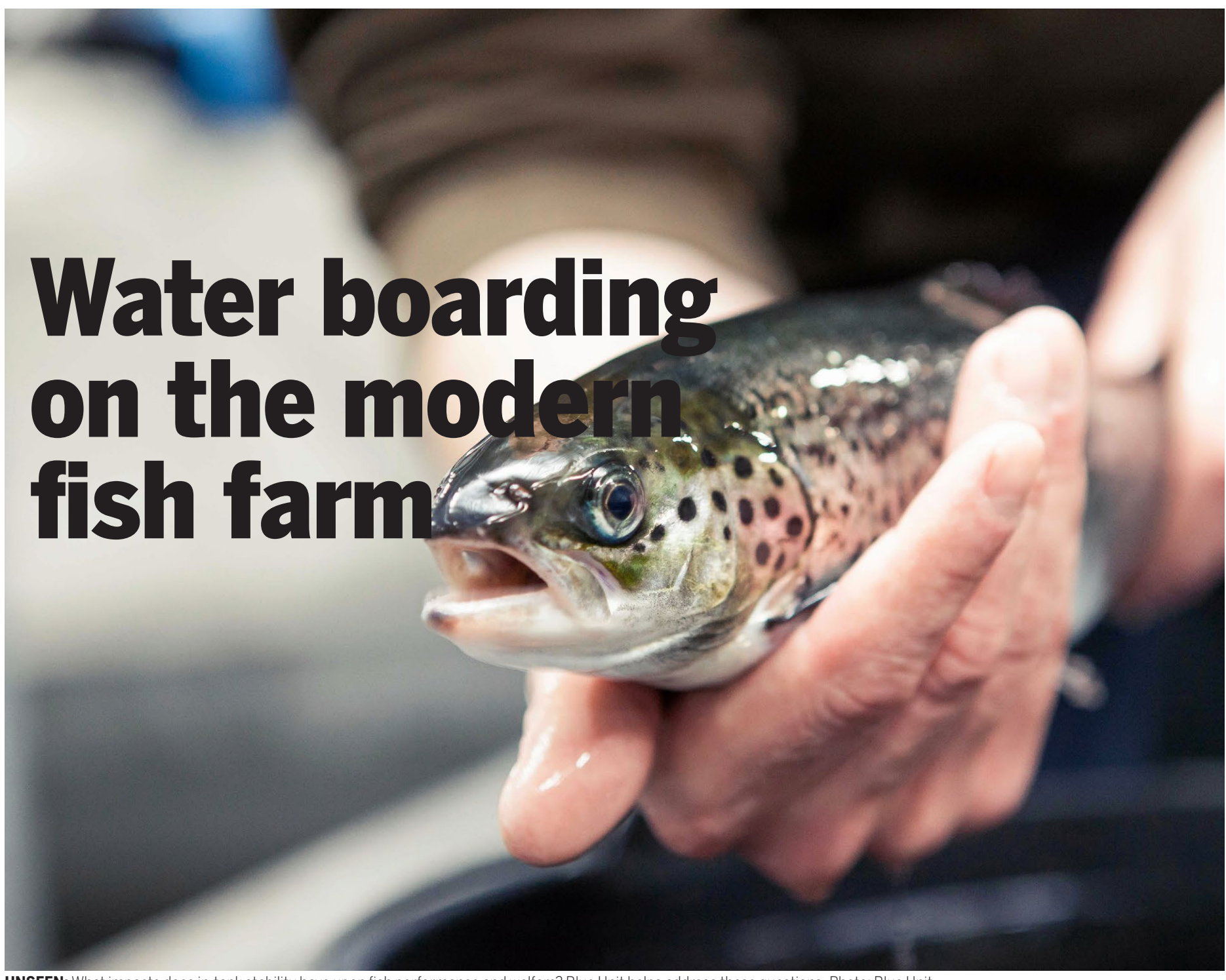
UNSEEN: What impacts does in-tank stability have upon fish performance and welfare? Blue Unit helps address these questions.

How do you know if your fish are inadvertently being throttled by rapidly deteriorating water quality?